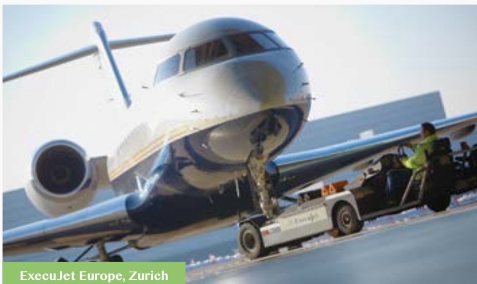
ExecuJet Europe, Zurich