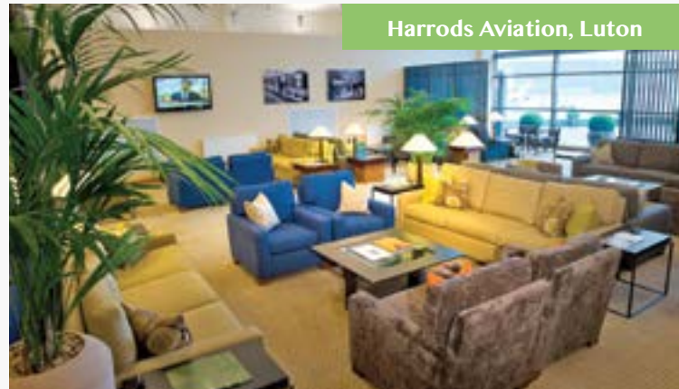
Harrods Aviation, Luton