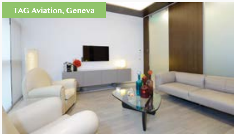
TAG Aviation, Geneva