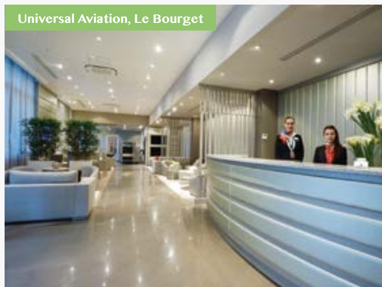
Universal Aviation, Le Bourget

Universal's catering subsidiary, Air Culinaire, operates its regional kitchen at Le Bourget, and representatives can meet arriving flights to arrange orders from an extensive menu, including special requests, with the crews.