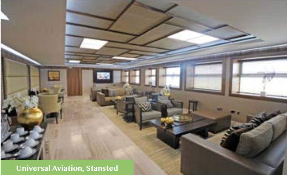
Universal Aviation, Stansted