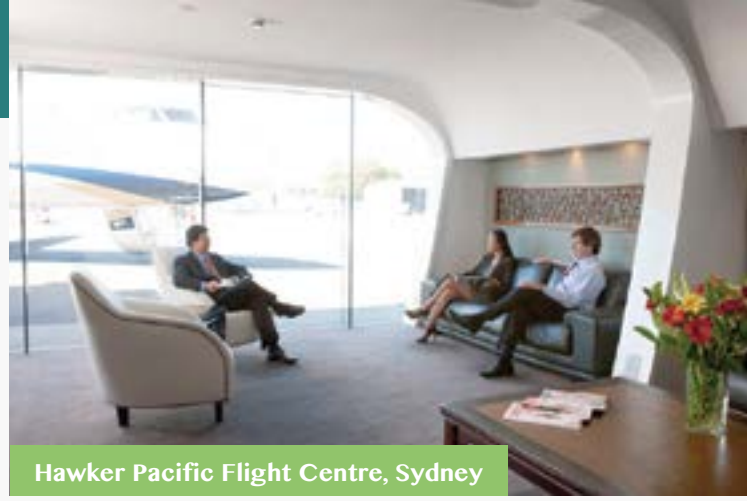
Hawker Pacific Flight Centre, Sydney

customers from the ramp directly to the customized security area for passenger and baggage screening, en route to the passenger lounges, which feature en suite bathrooms and shower facilities. The air-conditioned terminal has an executive bar area, A/V-equipped conference rooms with seating for up to 30 people, a private prayer