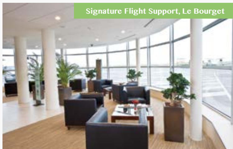
Signature Flight Support, Le Bourget